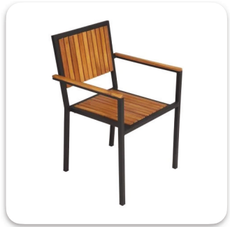
● Wooden patio chair 75cm wide