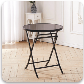
● Black metal table 70cm wide