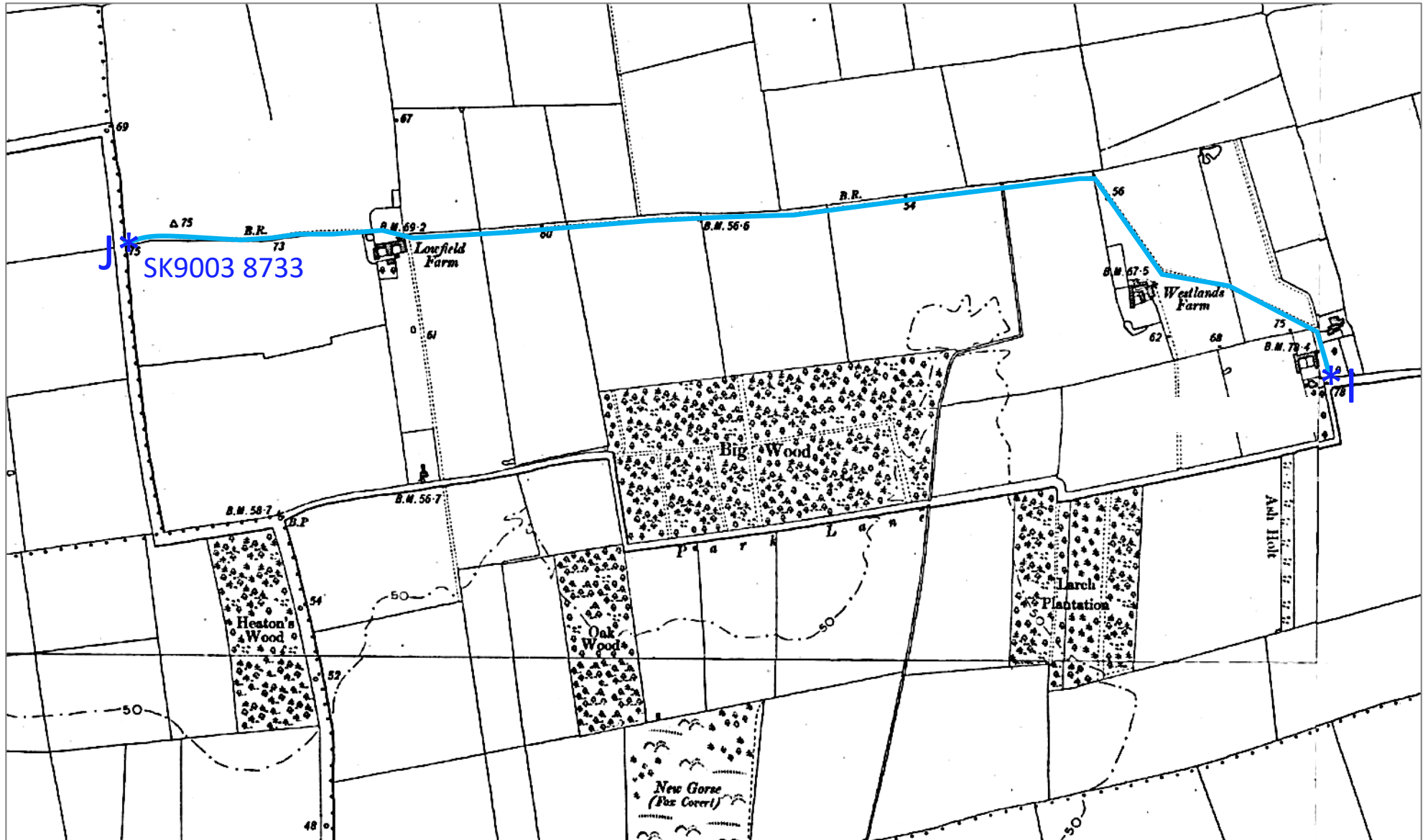
Glentworth – Upton BW 1907 OS 6in Lincs 44.SW & 51.NEat A4 size scale is about 1:8880