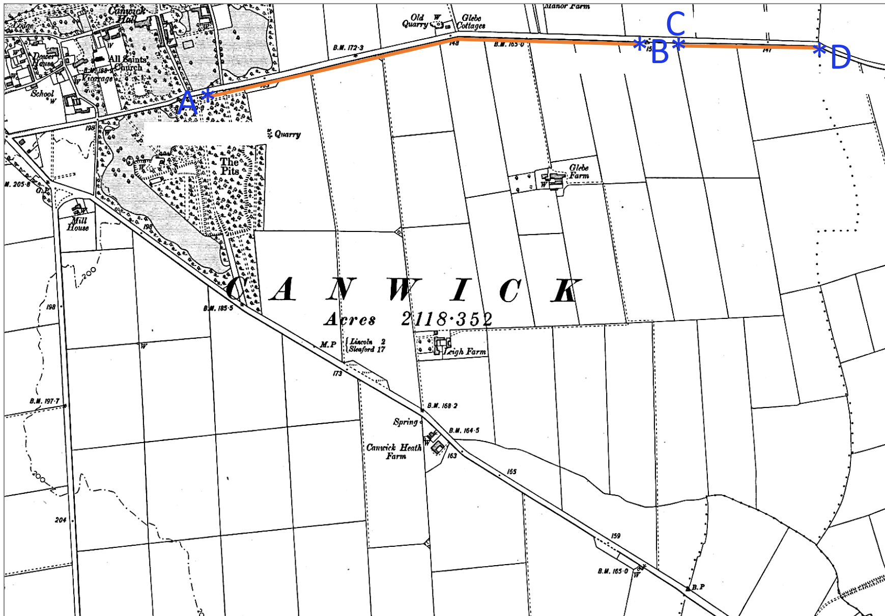
Canwick - Heighington Road FP 1908 OS 6in Lincs 70.SE at A4 size scale is about 1:10800