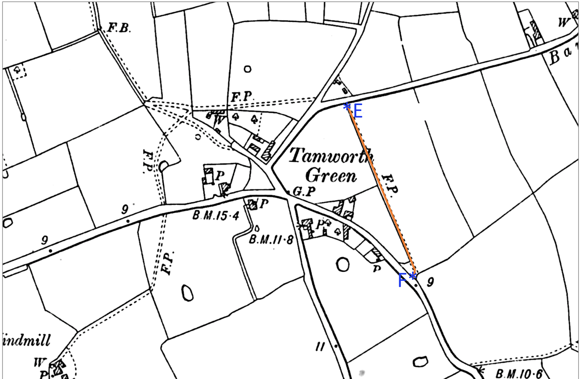
Freiston Mill Lane to Shore Road FP 1906 OS 6in Lincs 109.SE at A4 size scale is about 1:2636