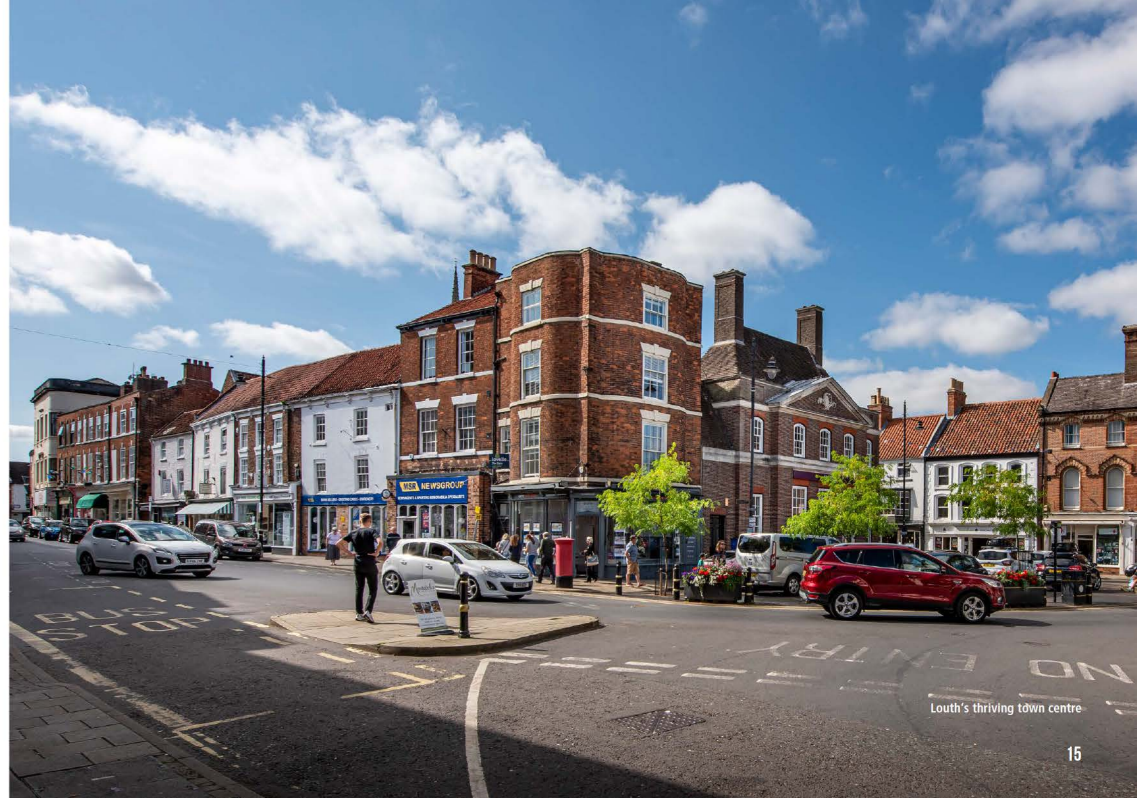
Louth's thriving town centre

we're on target to deliver superfast coverage countywide by 2025