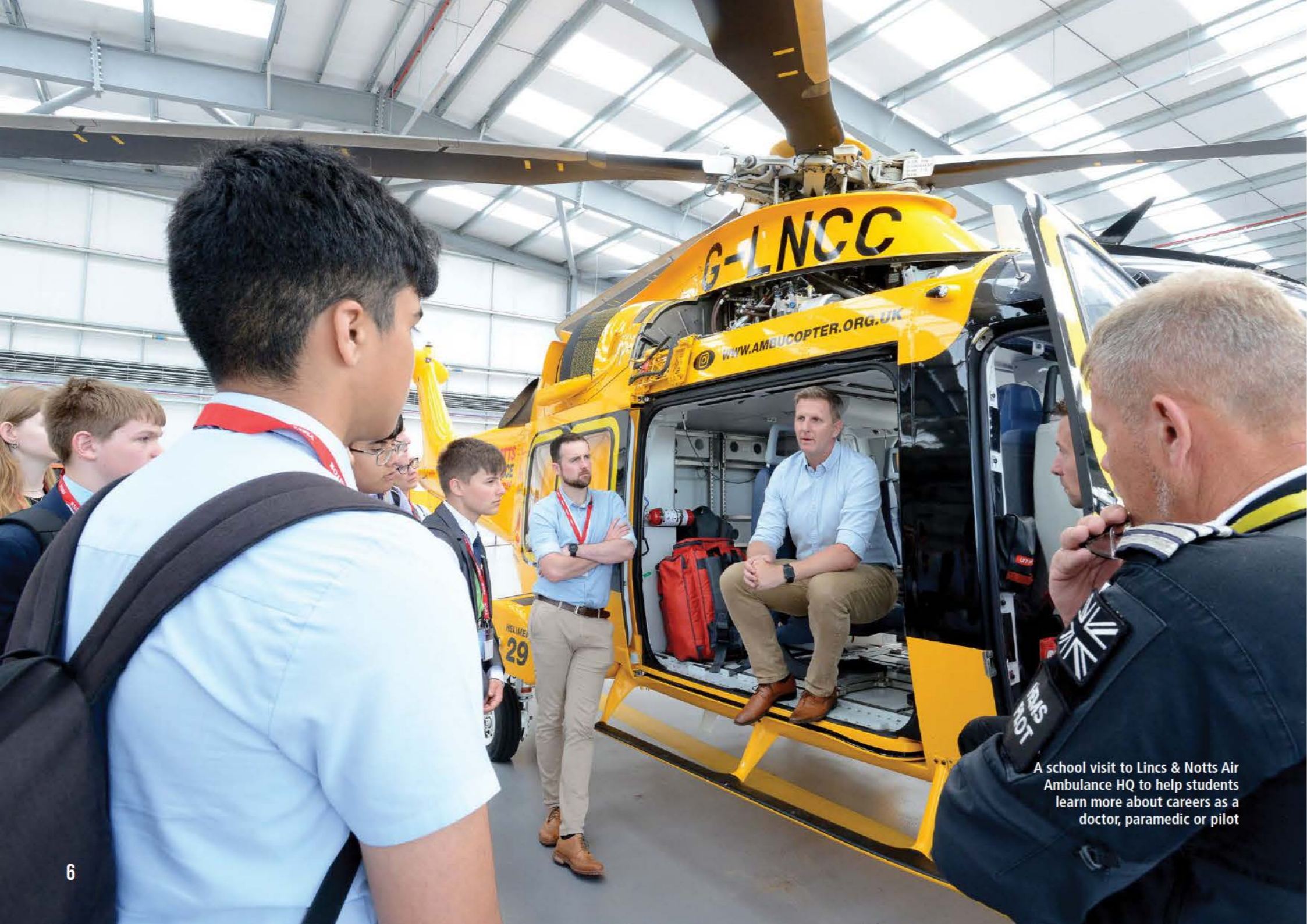
A school visit to Lincs & Notts Air Ambulance HQ to help students learn more about careers as a doctor, paramedic or pilot