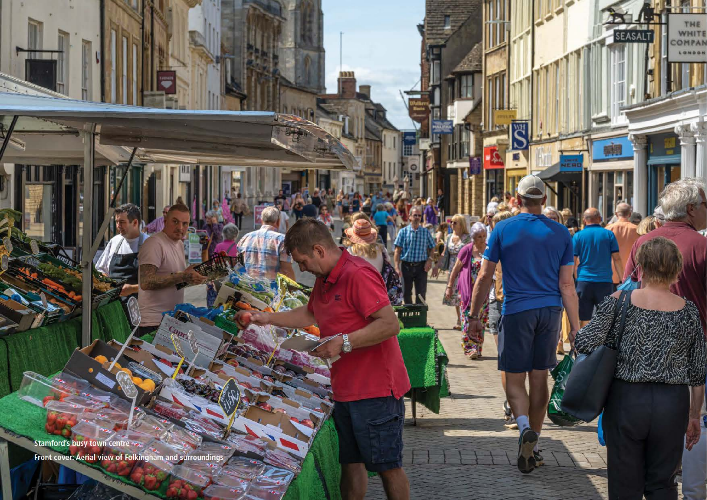
Stamford's busy town centre Front cover: Aerial view of Folkingham and surroundings