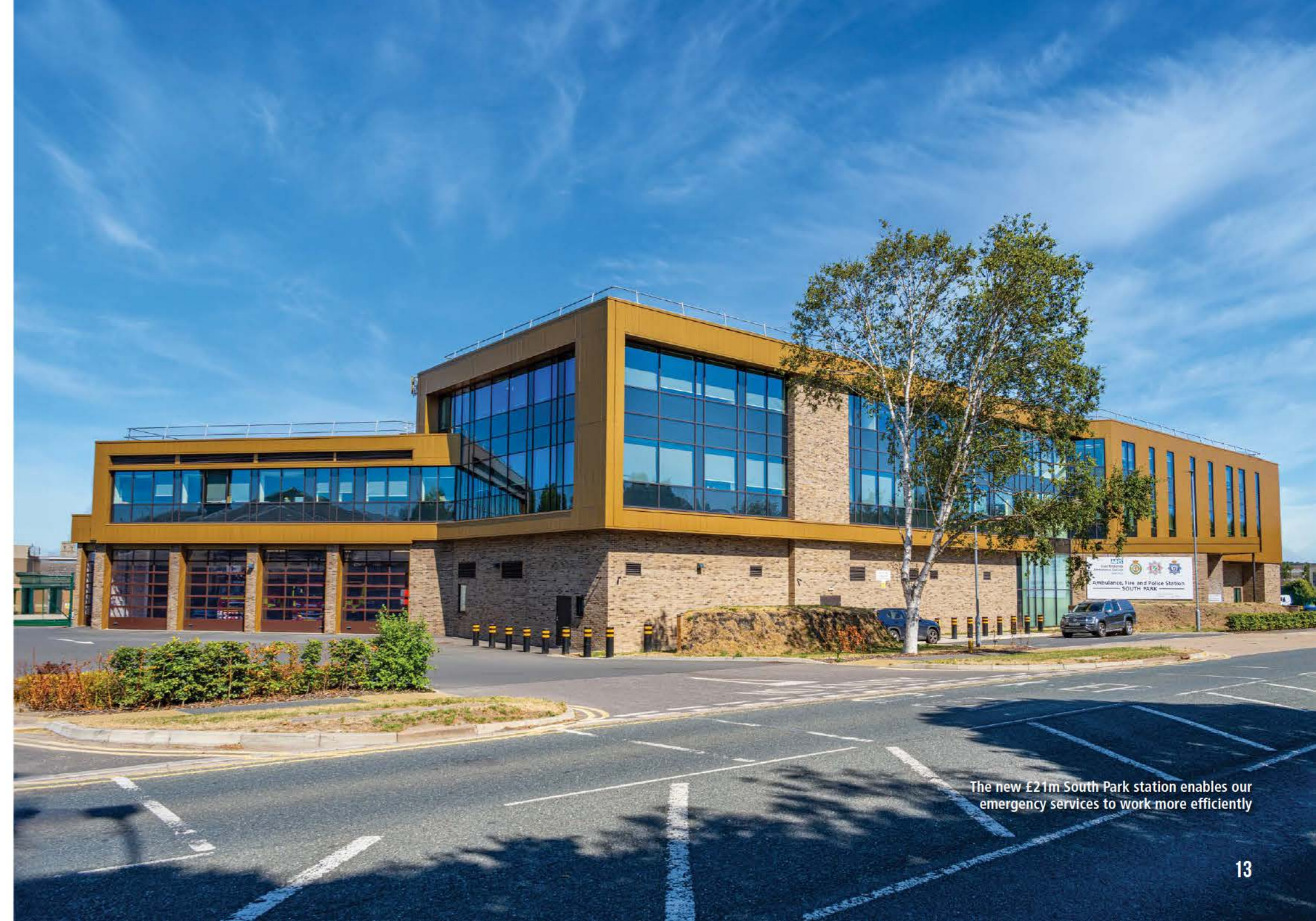
The new £21m South Park station enables our emergency services to work more efficiently