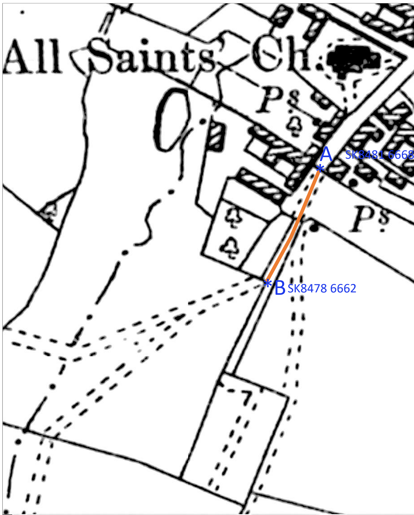
North Scarle Graveyard Gap 1905 OS 6in Lincs 77.NW at A4 size scale is about 1:1180