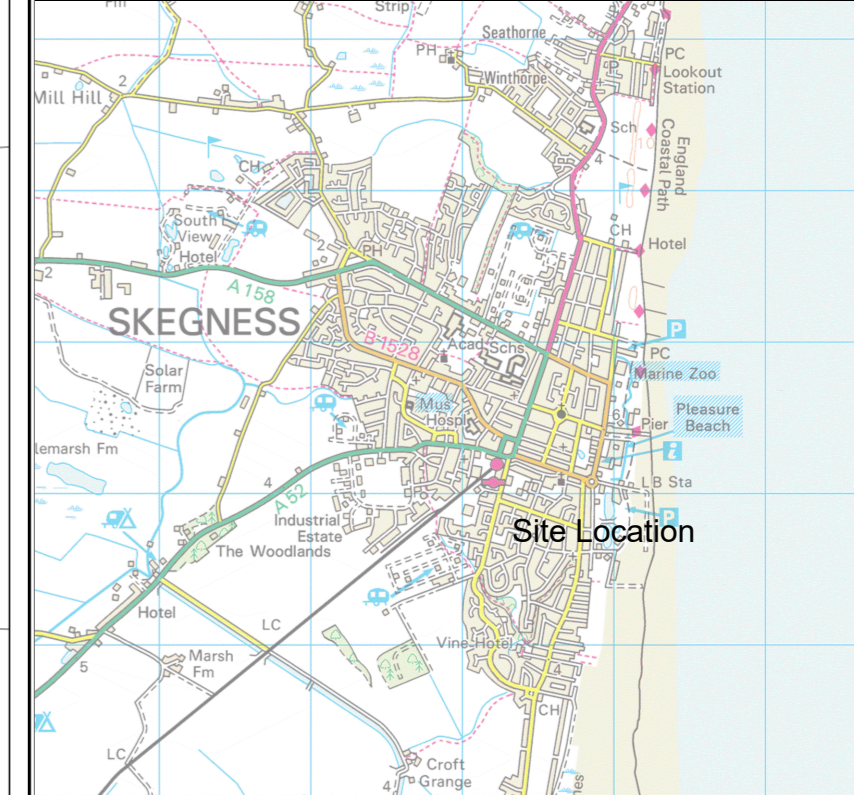
Location Plan Scale 1:50,000