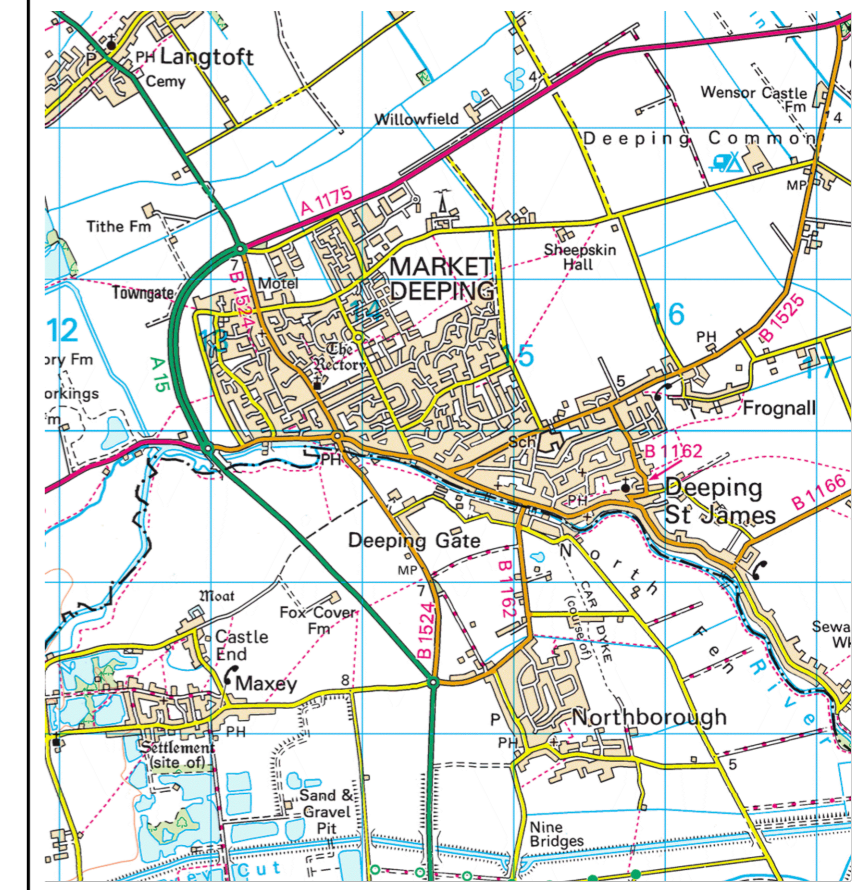
Location Plan (Scale 1:50,000)