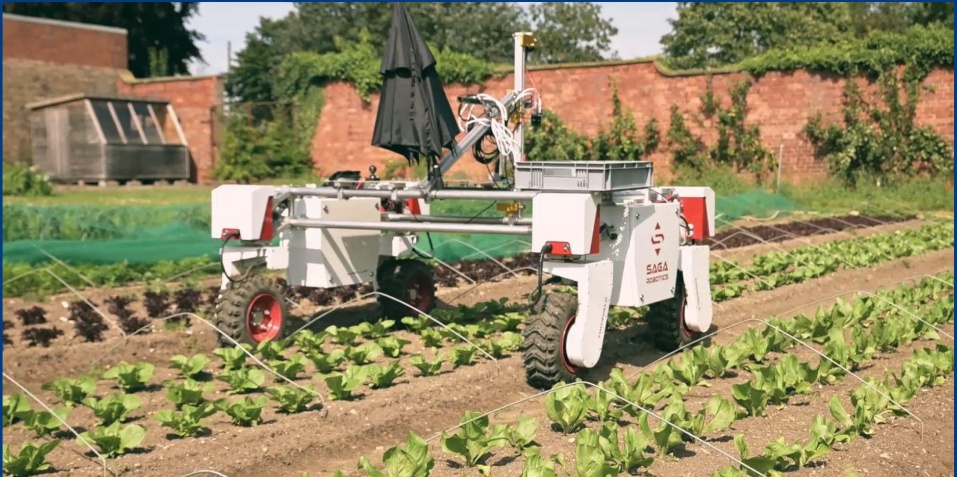
SAGA Robotics a Lincolnshire tech company in the UK Food Valley have developed an autonomous robot to perform tasks such as UV-C light treatment, picking fruits and vegetables, spraying and data collection/crop prediction. Reducing costs and labour market challenges in the fruit sector