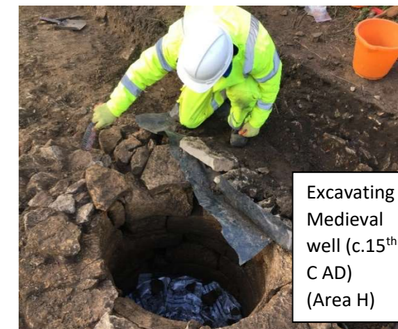
Excavating Medieval well (c.15 th C AD) (Area H)