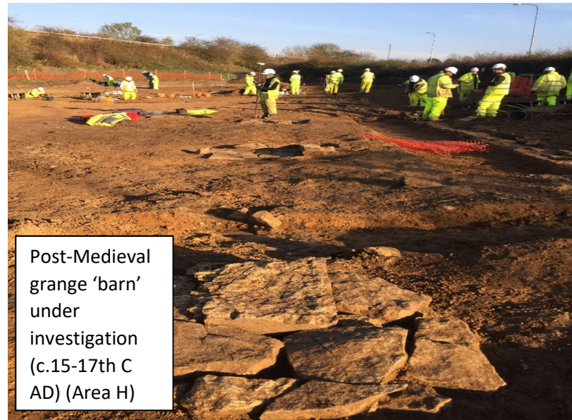
Post-Medieval grange 'barn' under investigation (c.15-17 th C AD) (Area H)