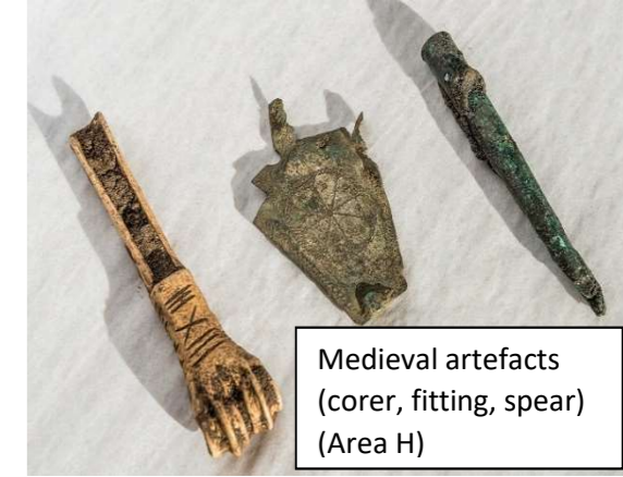
Medieval artefacts (corer, fitting, spear) (Area H)