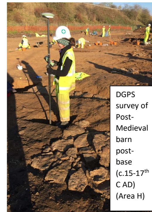
DGPS survey of Post-Medieval barn post-base (c.15-17 th C AD) (Area H)