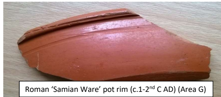
Roman 'Samian Ware' pot rim (c.1-2 nd C AD) (Area G)