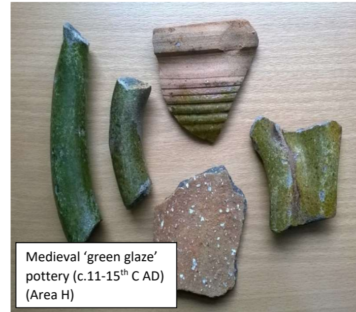
Medieval 'green glaze' pottery (c.11-15 th C AD) (Area H)