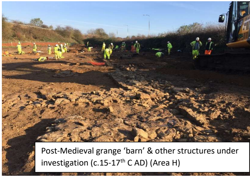
Post-Medieval grange 'barn' & other structures under investigation (c.15-17 th C AD) (Area H)