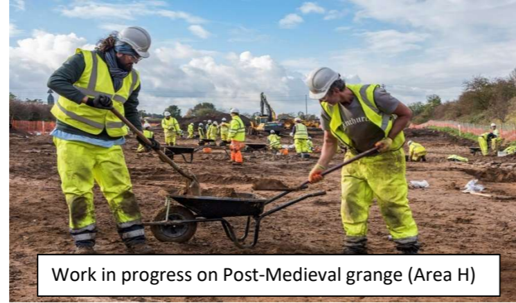
Work in progress on Post-Medieval grange (Area H)