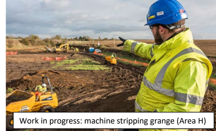
Work in progress: machine stripping grange (Area H)