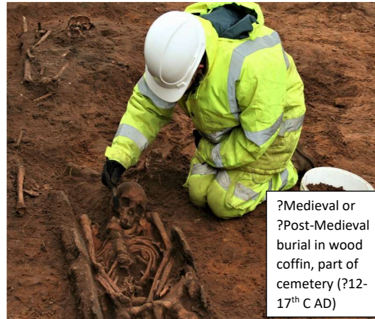
?Medieval or ?Post-Medieval burial in wood coffin, part of cemetery (?12-17 th C AD)