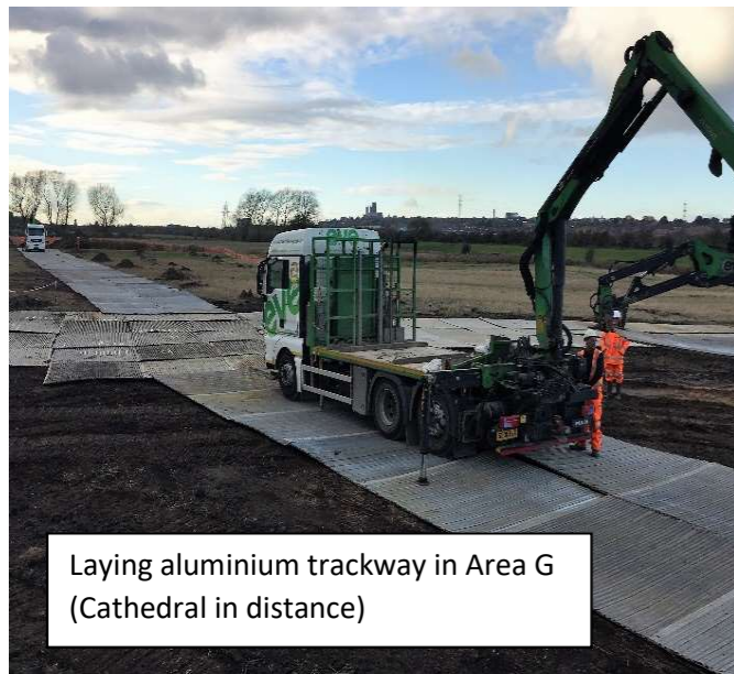
Laying aluminium trackway in Area G (Cathedral in distance)