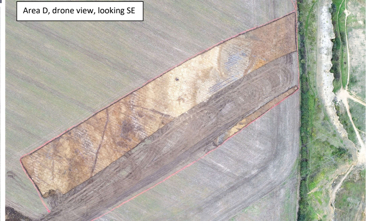
Area D, drone view, looking SE

Lincolnshire COUNTY COUNCIL Working for a better future