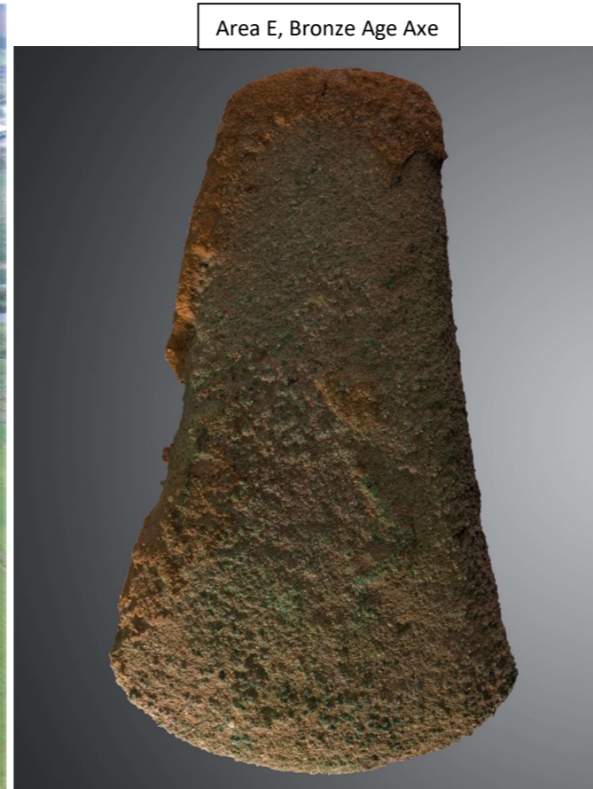
Area E, Bronze Age Axe