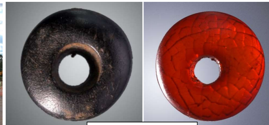
Area E, jet & amber beads