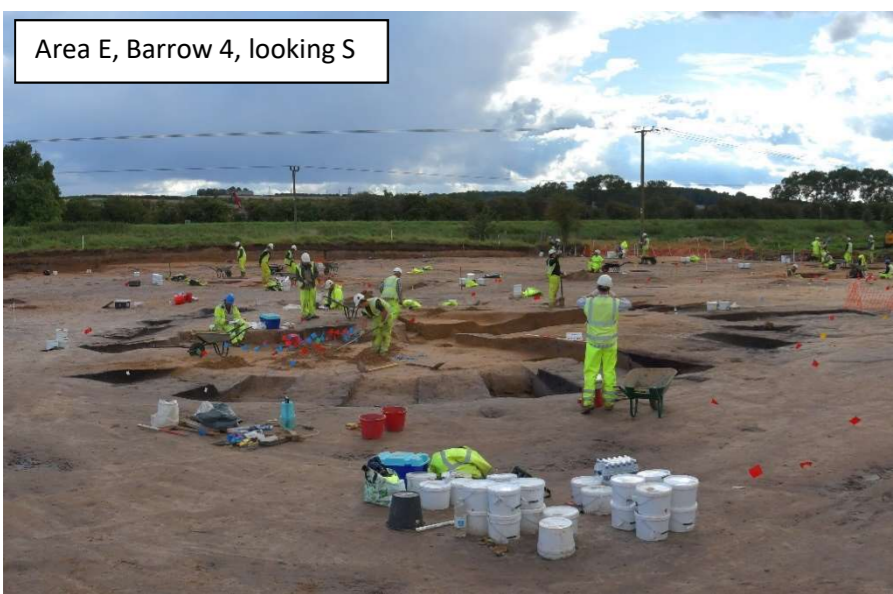
Area E, Barrow 4, looking S