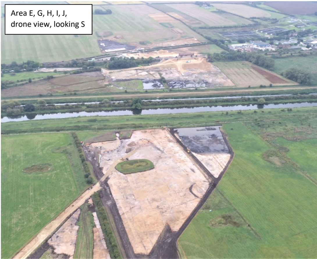
Area E, G, H, I, J, drone view, looking S