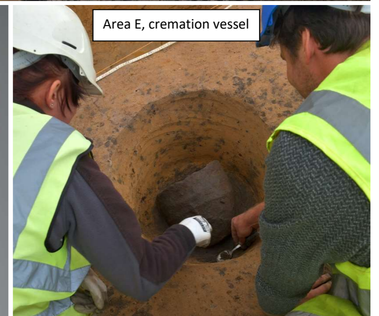
Area E, cremation vessel