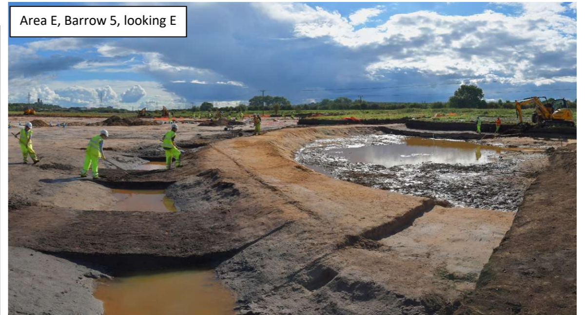
Area E, Barrow 5, looking E