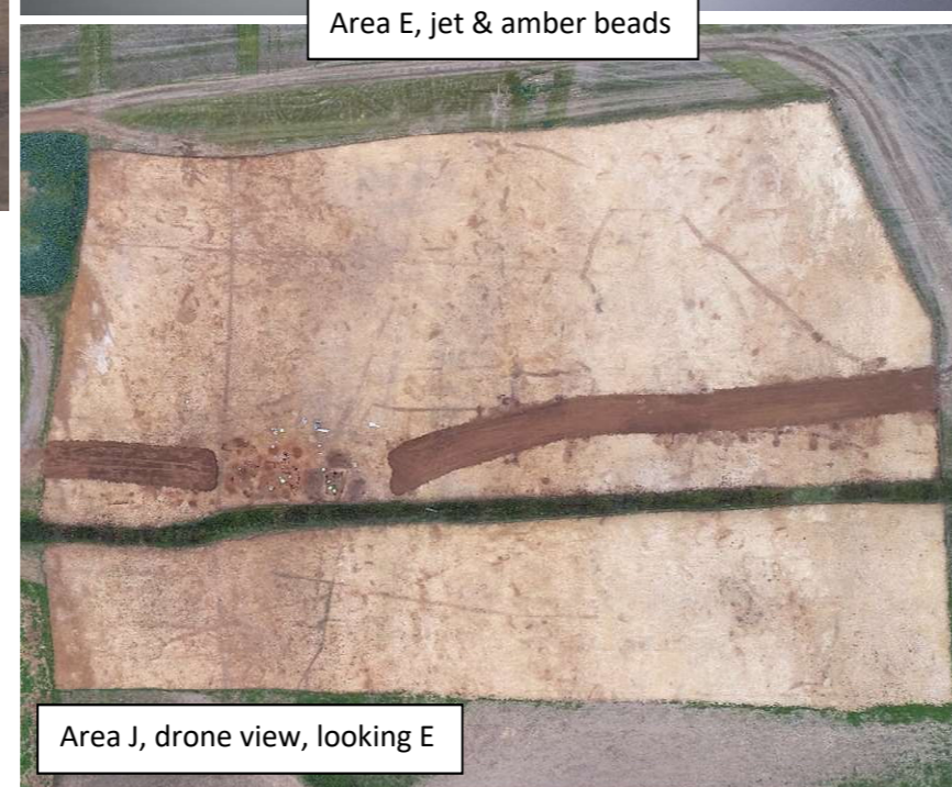
Area J, drone view, looking E