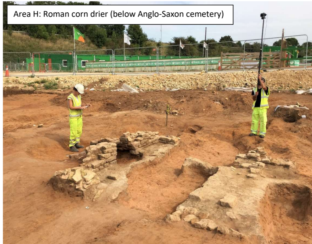
Area H: Roman corn drier (below Anglo-Saxon cemetery)