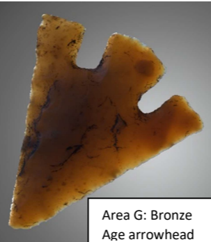
Area G: Bronze Age arrowhead