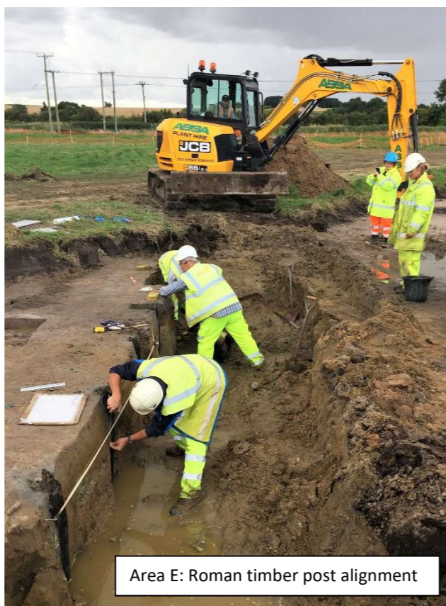
Area E: Roman timber post alignment

LINCOLN EASTERN BYPASS ARCHAEOLOGICAL WORKS – AREAS E, G, H WORK-IN-PROGRESS AND SELECTED ARTEFACTS (Progress Meeting 04/09/17)