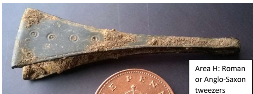
Area H: Roman or Anglo-Saxon tweezers