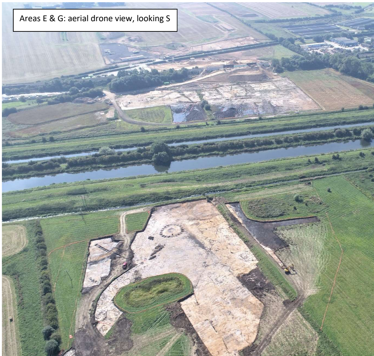
Areas E & G: aerial drone view, looking S