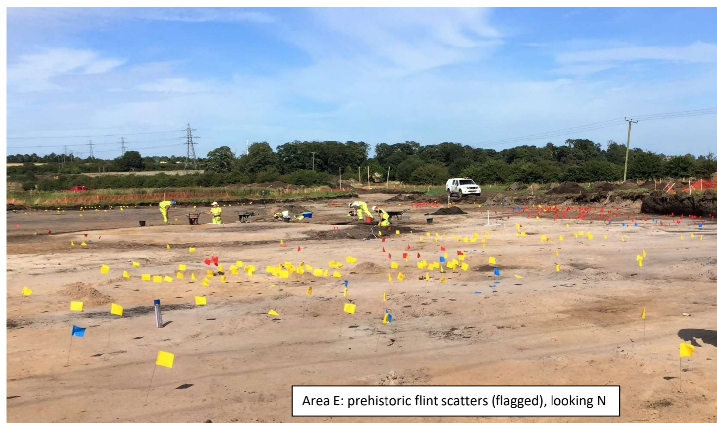
Area E: prehistoric flint scatters (flagged), looking N