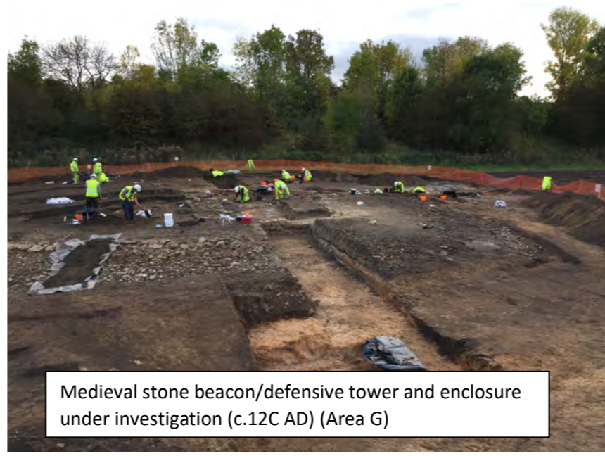
Medieval stone beacon/defensive tower and enclosure under investigation (c.12C AD) (Area G)