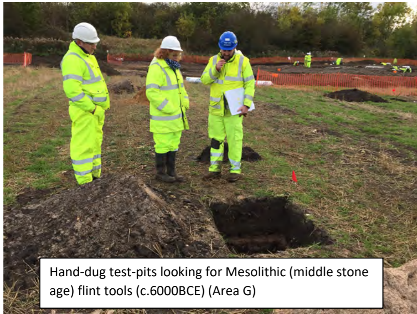
Hand-dug test-pits looking for Mesolithic (middle stone age) flint tools (c.6000BCE) (Area G)