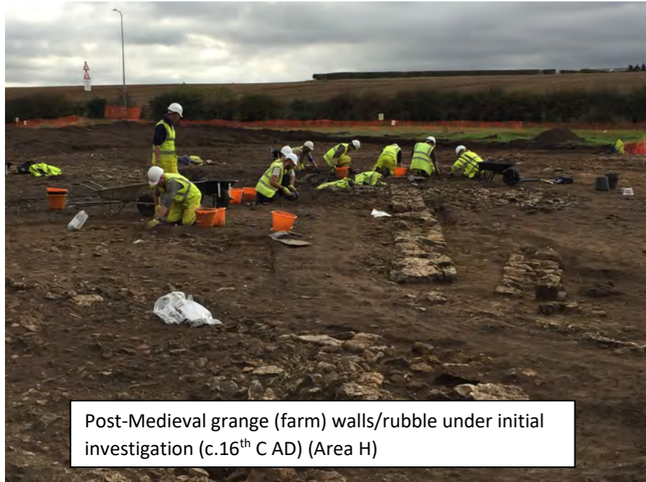
Post-Medieval grange (farm) walls/rubble under initial investigation (c.16 th C AD) (Area H)