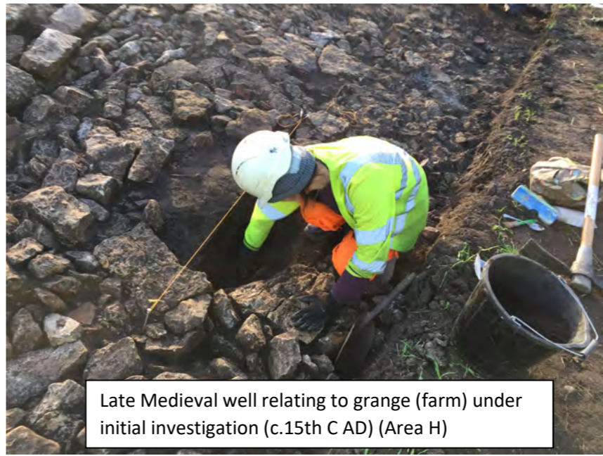
Late Medieval well relating to grange (farm) under initial investigation (c.15 th C AD) (Area H)