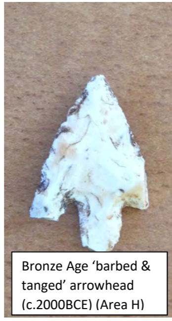
Bronze Age 'barbed & tanged' arrowhead (c.2000BCE) (Area H)