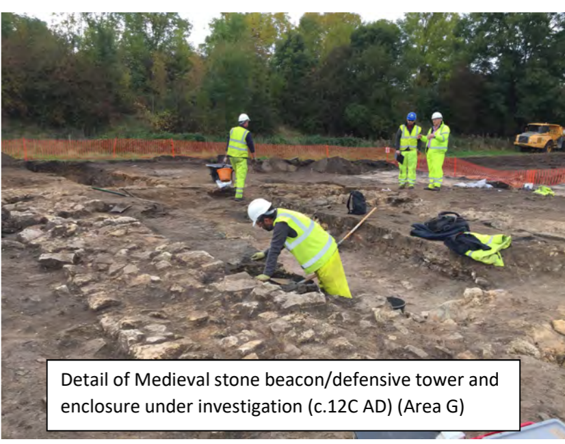
Detail of Medieval stone beacon/defensive tower and enclosure under investigation (c.12C AD) (Area G)