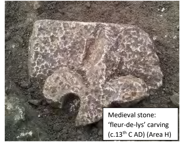
Medieval stone: 'fleur-de-lys' carving (c.13 th C AD) (Area H)