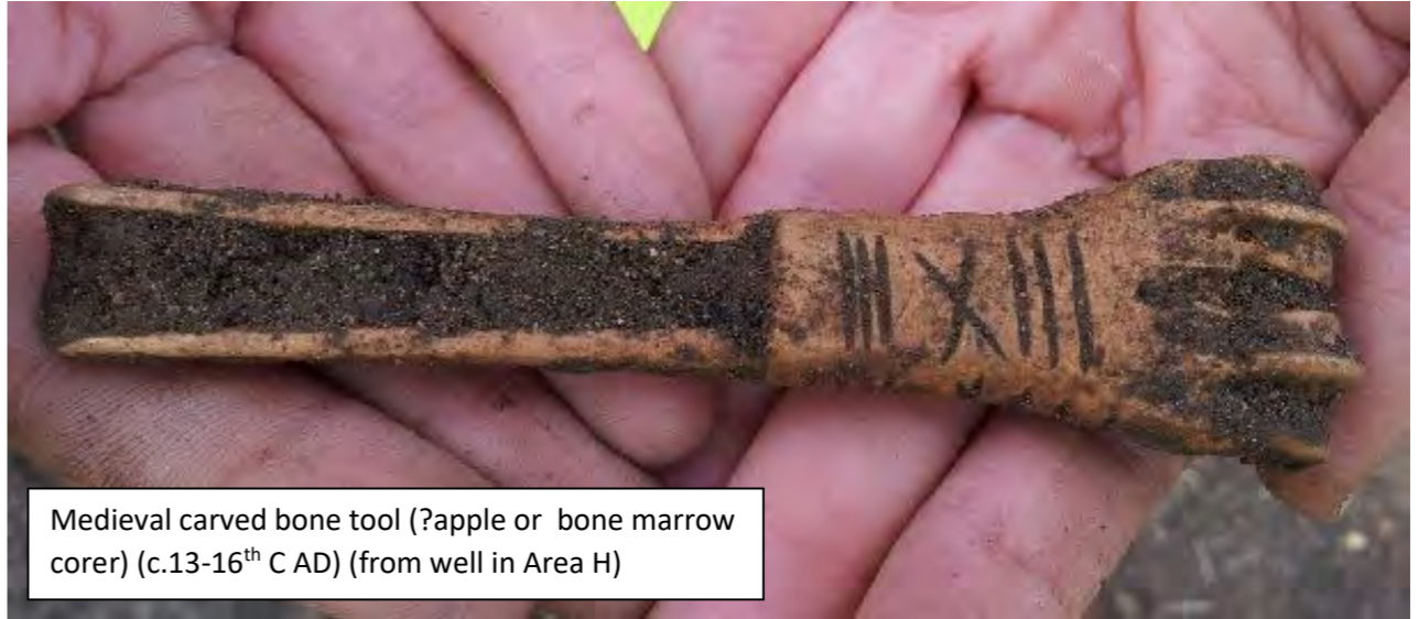
Medieval carved bone tool (?apple or bone marrow corer) (c.13-16 th C AD) (from well in Area H)