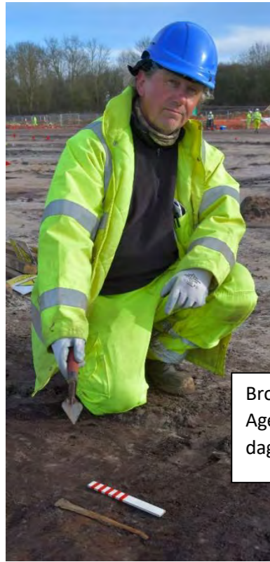
Bronze Age dagger