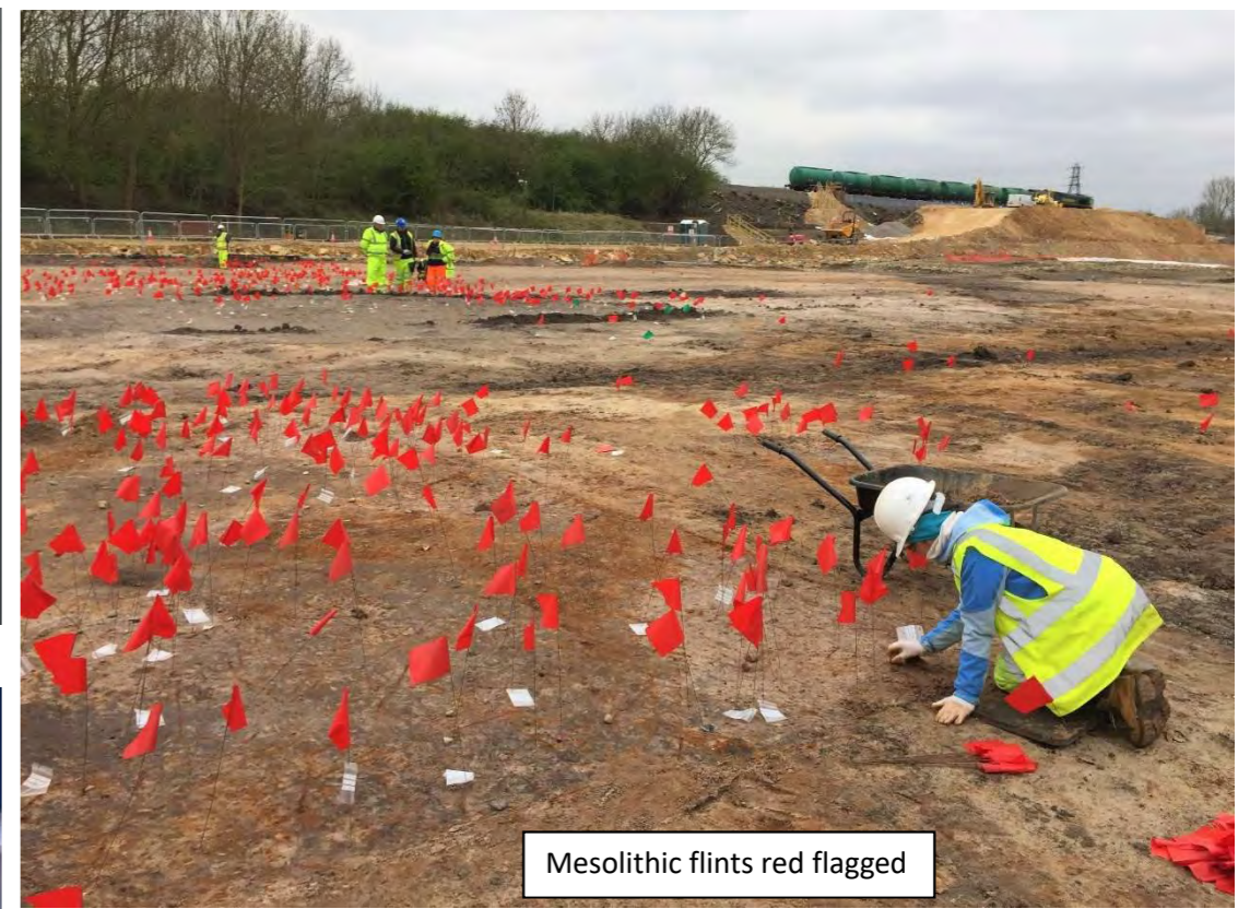
Mesolithic flints red flagged