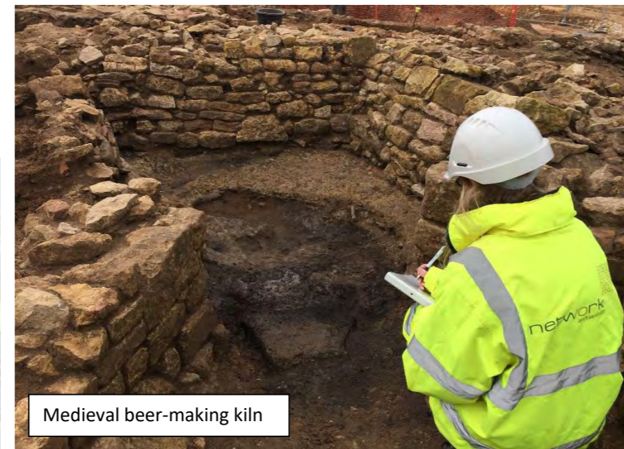
Medieval beer-making kiln