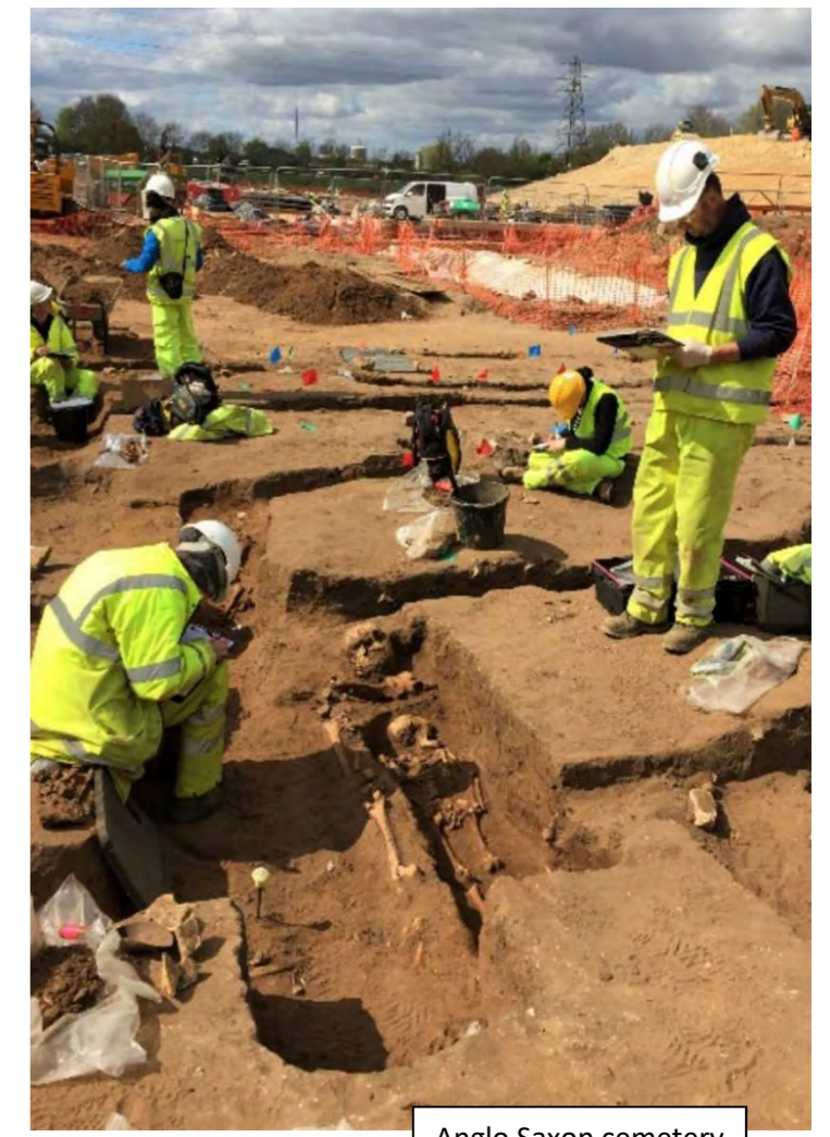
Anglo Saxon cemetery