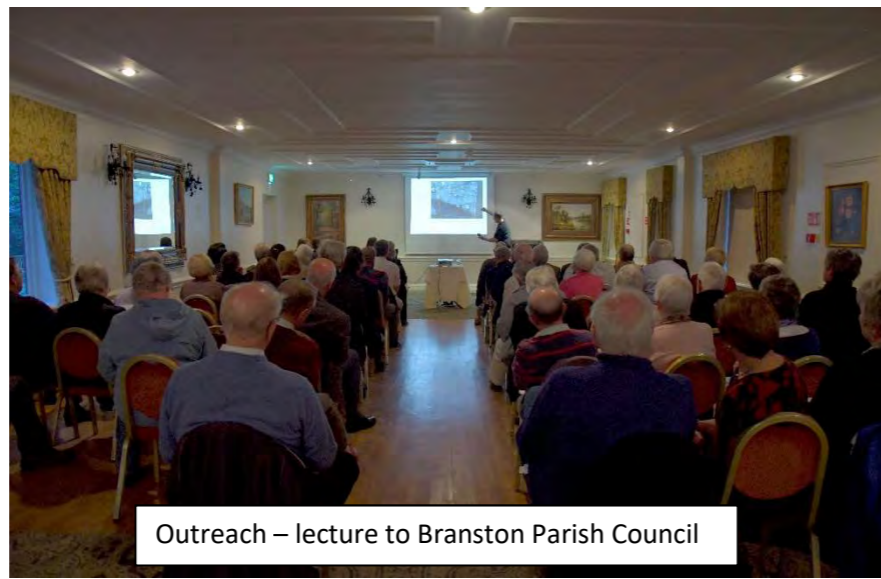
Outreach – lecture to Branston Parish Council