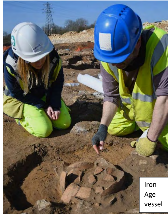
Iron Age vessel