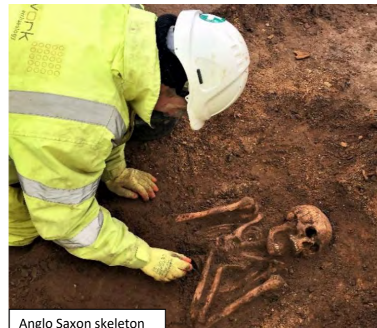
Anglo Saxon skeleton