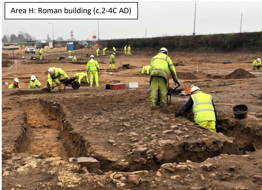
Area H: Roman building (c.2-4C AD)