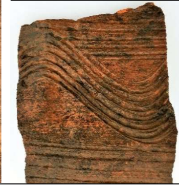
Area H: Roman 'combed' 'hypocaust' tile