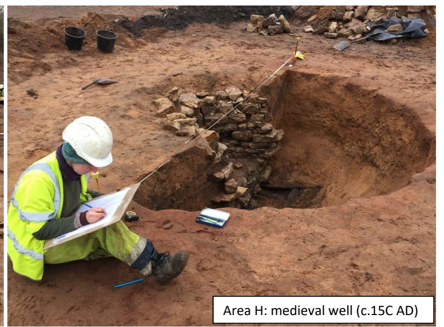
Area H: medieval well (c.15C AD)