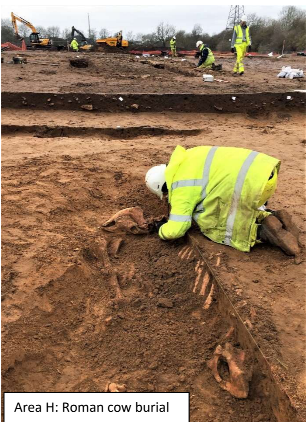
Area H: Roman cow burial