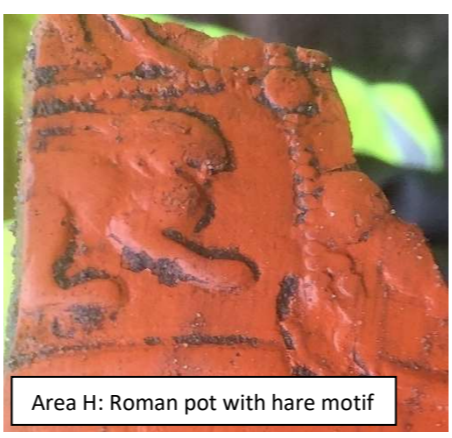
Area H: Roman pot with hare motif