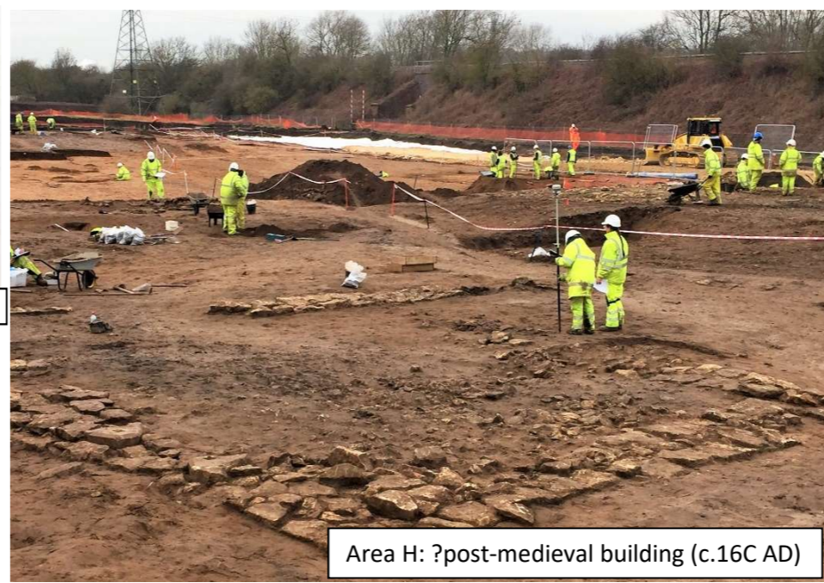
Area H: ?post-medieval building (c.16C AD)