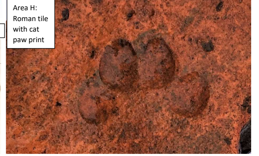
Area H: Roman tile with cat paw print

LINCOLN EASTERN BYPASS ARCHAEOLOGICAL WORKS – AREAS G AND H WORK-IN-PROGRESS AND SELECTED ARTEFACTS (Progress Meeting 30/01/17)