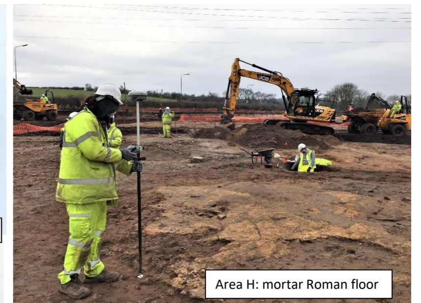
Area H: mortar Roman floor