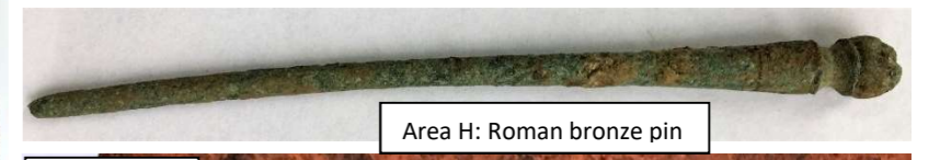
Area H: Roman bronze pin