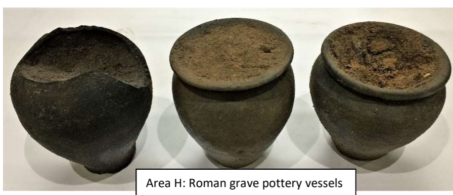
Area H: Roman grave pottery vessels