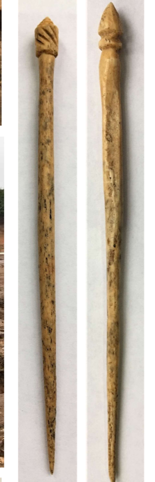
Area H: Roman bone pins