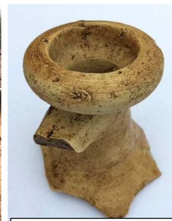
Area H: Roman flagon rim