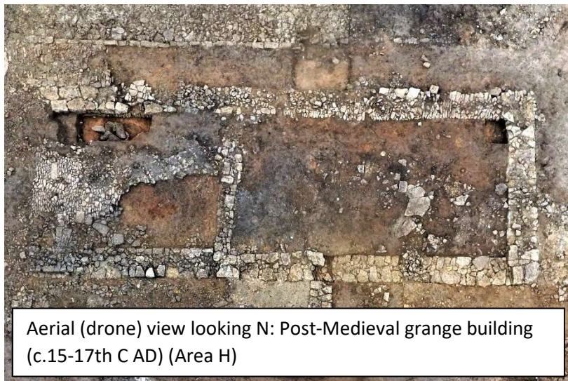
Aerial (drone) view looking N: Post-Medieval grange building (c.15-17th C AD) (Area H)