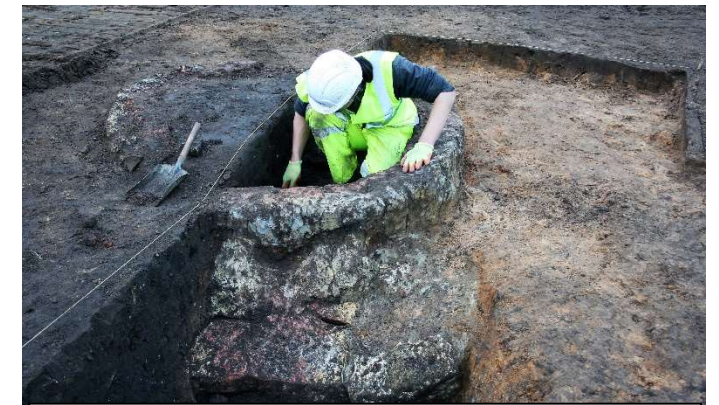
Excavating Roman pottery kiln (c.1-4th C AD) (Area G)