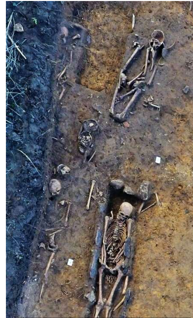
Cemetery: ?Medieval or ?Post-medieval (c.11-17th C AD) (Area H)