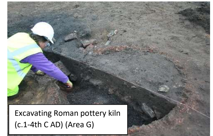
Excavating Roman pottery kiln (c.1-4th C AD) (Area G)