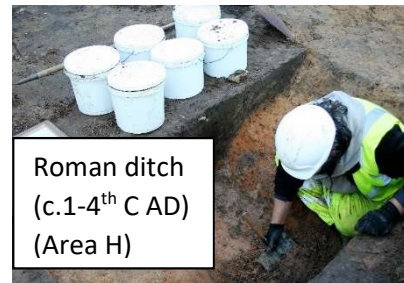
Roman ditch (c.1-4th C AD) (Area H)