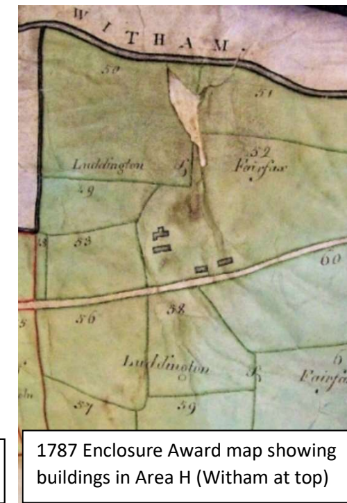
1787 Enclosure Award map showing buildings in Area H (Witham at top)