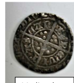
Medieval coin (Area H)