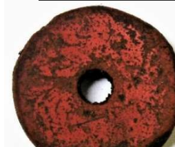
?Medieval ceramic loom weight (Area H)