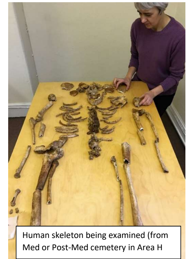
Human skeleton being examined (from Med or Post-Med cemetery in Area H)