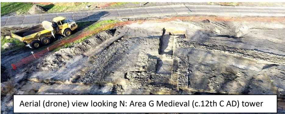
Aerial (drone) view looking N: Area G Medieval (c.12th C AD) tower