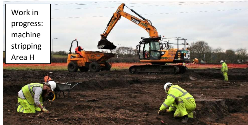
Work in progress: machine stripping Area H