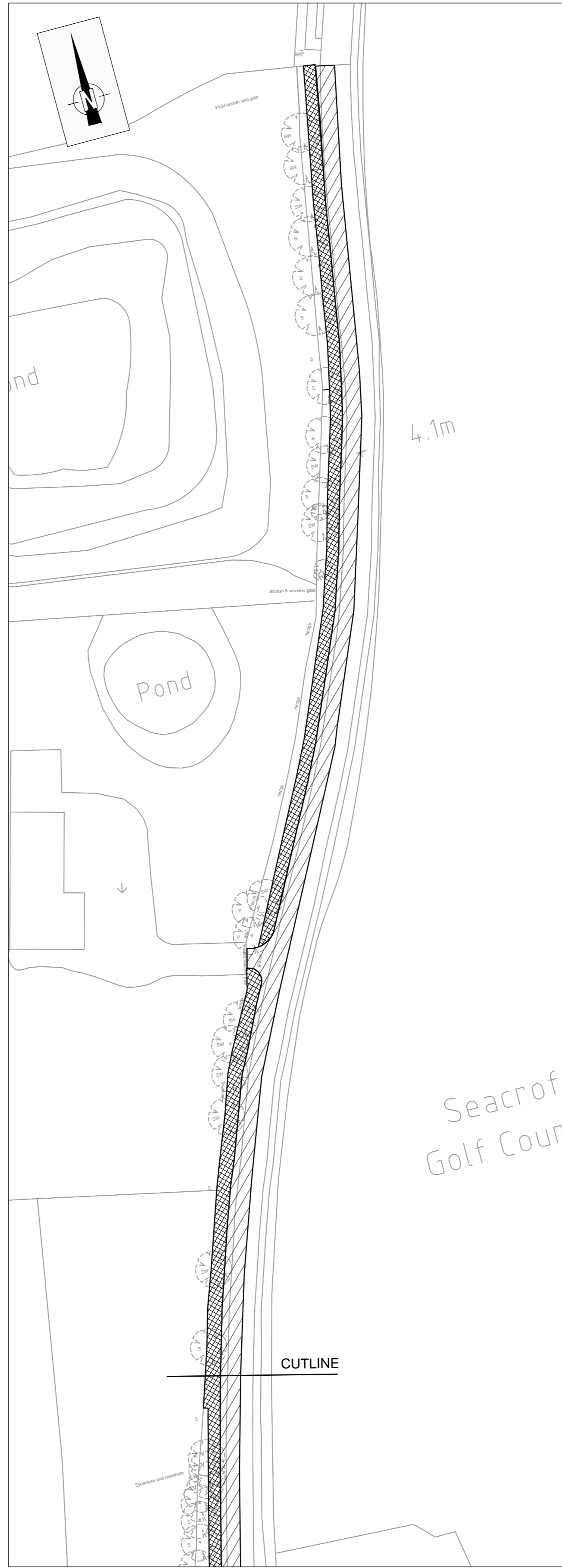
Inset 2 Scale 1:500