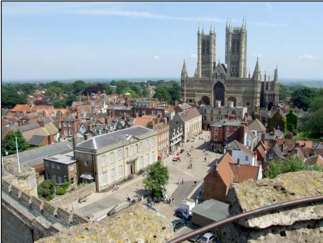
The Proposed Scheme will be only visible from the very top of Lincoln Castle Tower.

To mitigate for those archaeological features that will be destroyed or damaged by the road construction, an extensive programme of investigation and recording will be undertaken.